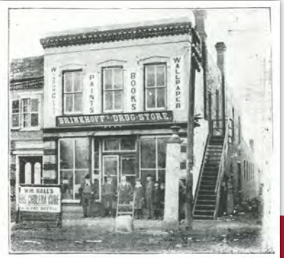
Allen & Stubenrauch's Drug Store

Good things have a way of coming together!